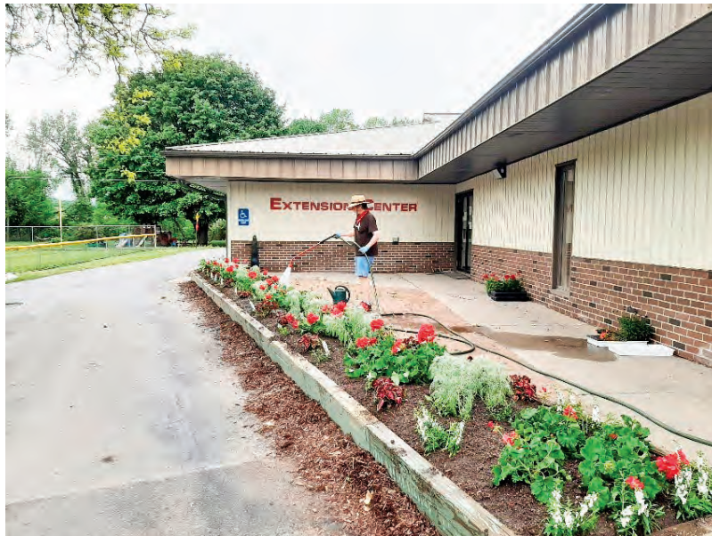
Schoharie Master Gardener Scott Mills waters in new plants in the Extension Center's main entrance planter.