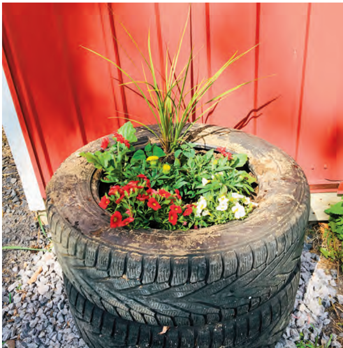
Alex Badger built planters and filled them with annuals.