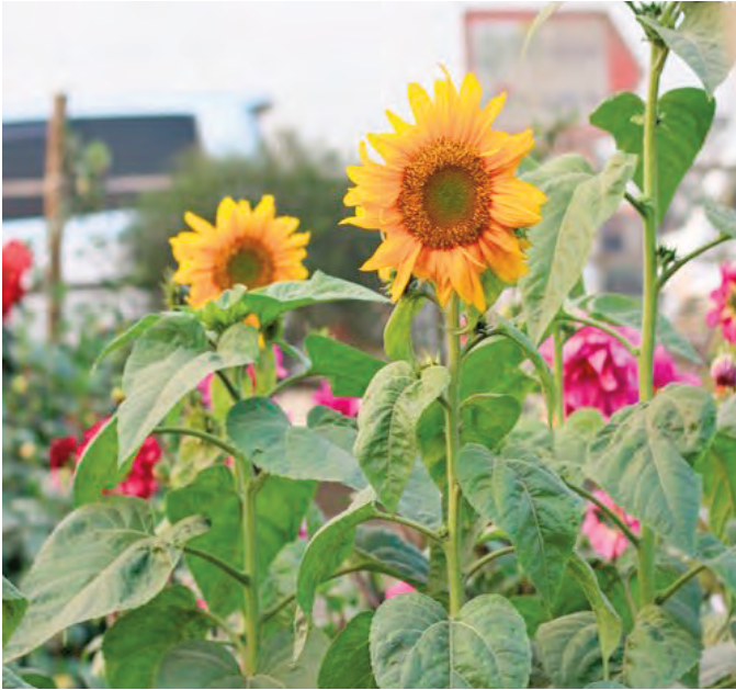
Did you know sunflowers are composite flowers and that each sunflower is actually thousands of teeny tiny flowers called florets grouped together making up the massive bloom?

Interested in becoming a Master Gardener Volunteer? Cornell Cooperative Extension (CCE) of Chenango, Delaware, Herkimer, and Schoharie and Otsego Counties are accepting applications from area residents looking to participate in this popular statewide (and national) public-service program. The Master Gardener Program is open to anyone with a genuine interest in floral and food gardening and a willingness to share knowledge, experience, and enthusiasm with constituents in your local community.