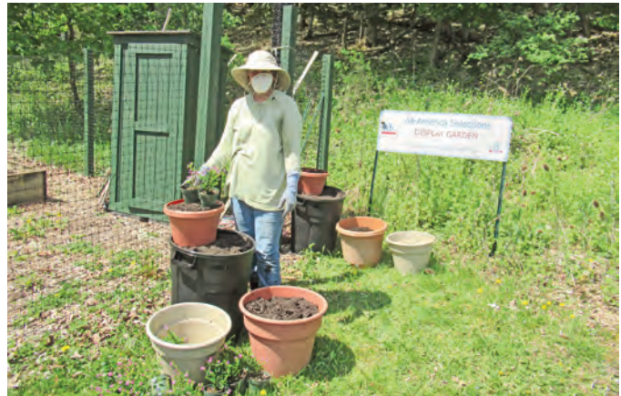
Otsego Master Gardener's prepare garden beds for self-guided tours.

COVID-19 shutdown and into the re-opening period, the Master Gardeners in both counties were able to attend to the Helplines and social-media inquiries, prepare soil samples, perform pH tests, and prepare for their outreach season with COVID-19 protocols. The GROW program, for example, established new projects and renewed past projects that include the much-enhanced Oneonta Community Gardens, through a $25K grant from the City of Oneonta, Nader Towers, Oneonta Heights, the Chestnut Park Nursing Home, and recently the Family Resource Network. The Goal-oriented Rural Outreach Work (GROW) initiative is a mini-grant project that partners Master Gardeners with organizations in Otsego County who desire to develop and implement a project that promotes and extends horticultural and environmental practices consistent with Cornell Cooperative Extension. Successful proposals briefly identify purpose, intent, project timeline, and the community partners with whom Master Gardeners will collaborate. Look for our next issue of Connections for an update on these worthy projects, pictures included, because we know one says a thousand words. Stay tuned as more education and outreach evolves!