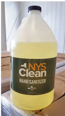
One-gallon bottle of NYS CLEAN hand sanitizer