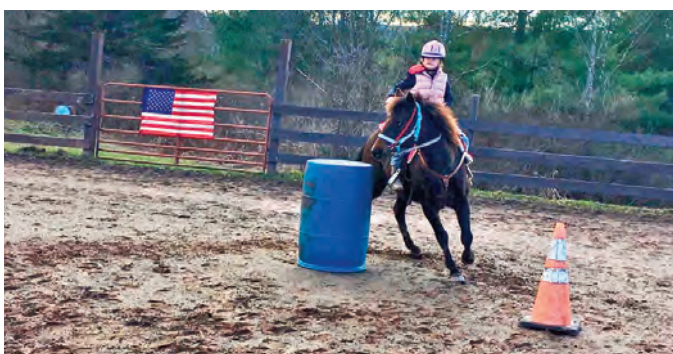
A Happy Hoofster and her partner working the barrels.