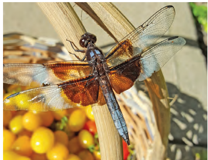
Did you know dragonflies don't sting and generally don't bite people, because adult dragonflies only eat when flying?

For details about the 2020 Master Gardener Volunteer Training or to receive an application, contact your county CCE association office: CCE Chenango County, 607-334-5841, ext. 20; CCE Delaware County, 607-865-6531, ceh27@cornell.edu ; CCE Herkimer County, 315-866-7920, herkimer@cornell.edu ; CCE Schoharie and Otsego Counties, 518-234-4303, ext. 111, schoharie@cornell.edu . Or visit http://cceschoharie-otsego.org/gardening/master-gardener-volunteer-training for a position description and application. CCE provides equal program and employment opportunities. Accommodations for persons with special needs may be requested by contacting Cornell Cooperative Extension Schoharie and Otsego Counties by Friday, August 21, 2020.