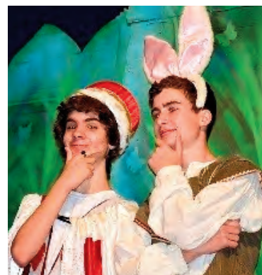
The King and White Rabbit

In 2017 the Hartwick 4-H Actors' Guild's production of "Alice in Wonderland" was youth directed, and their 2018 production of "The Lion, the Witch, and the Wardrobe" will be as well! Join them at the Hartwick Community Center, Hartwick, NY, on April 6, 7, 13, and 14, at 7 p.m. for an enjoyable performance.