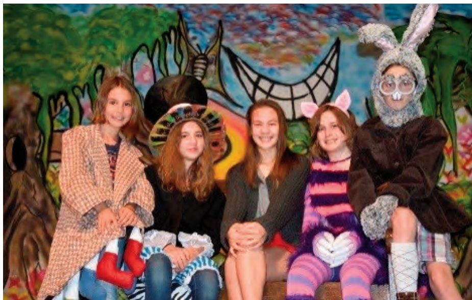
Communication Arts group: Caterpillar, Mad Hatter, Young Alice, Cheshire Cat, and The March Hare

In Otsego County the Hartwick 4-H Actors' Guild is providing a unique venue for 4-H members to experience Communication Arts and build creatively on the foundation of 4-H Public Presentations. Youth, ages five to nineteen, learn how to express themselves in and out of character. A few weeks of theater can transform a shy introverted youth to a main stage actor! Most youth will not become professional actors, but 4-H youth will be recognized as better communicators with valuable life skills.