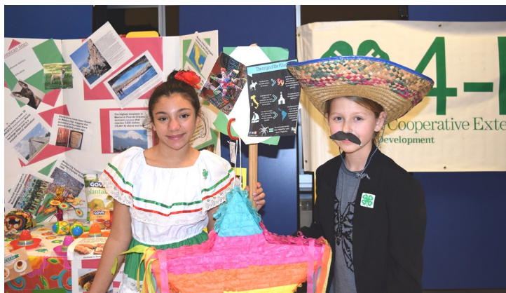
2018 4-H International Night

On February 1 st , each 4-H Club will have a table to show and tell what they learned about their country.