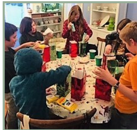
Making supply bags