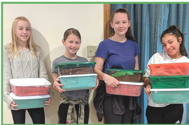
Shoeboxes for Seniors