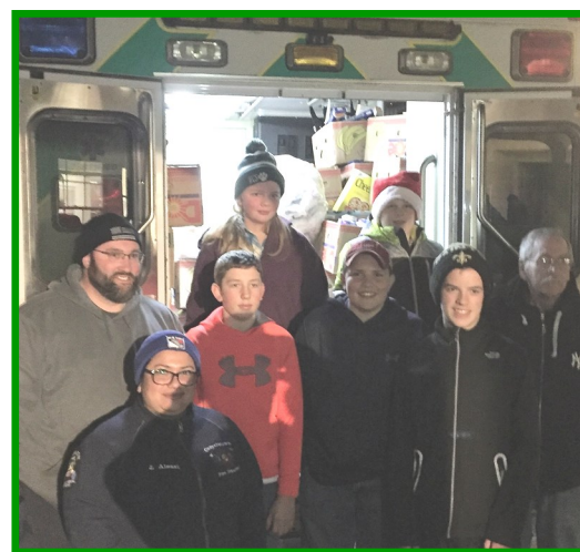
4-H Food Bank Helpers

Whatever Floats Your Goat 4-H club helped the Cooperstown Fire Department unload over 3,000 pounds of food that was donated to the Cooperstown Food Bank at Price Chopper on Saturday December 15.