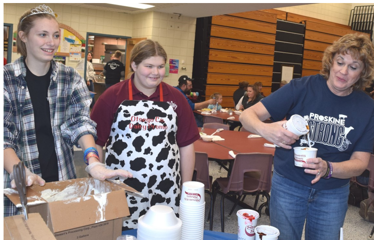
Dairy Promotion ladies serve up Stewart's sundaes