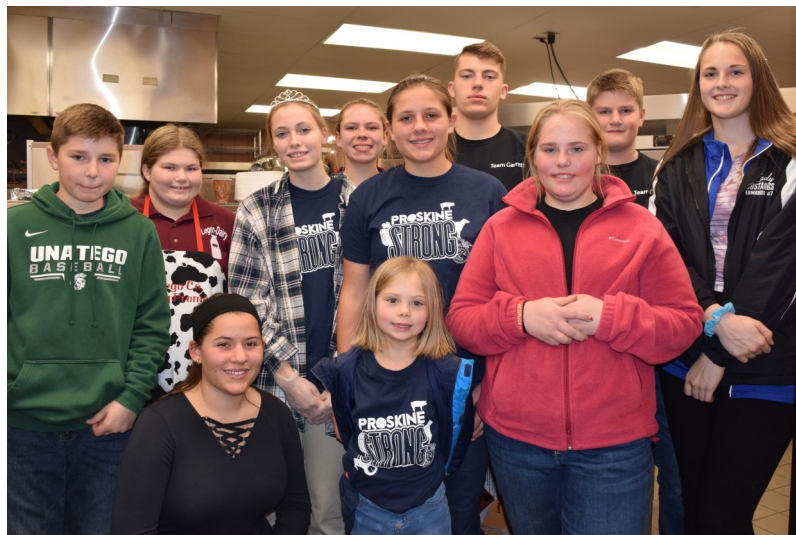
Gilbertsville Dairy 4-H Club - Proskine Strong! See article on page 5