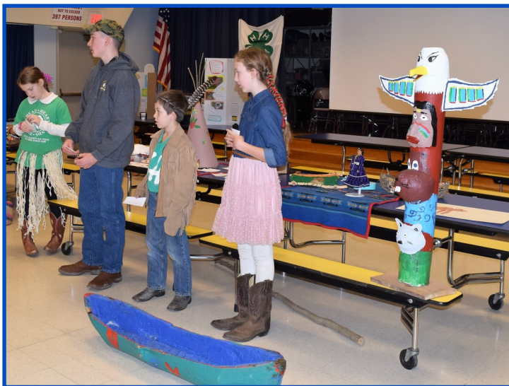
2019 4-H International Night

The 4th Annual 4-H International Night will be held on February 7th, when each 4-H Club will have a table to show and tell what they learned about their country.