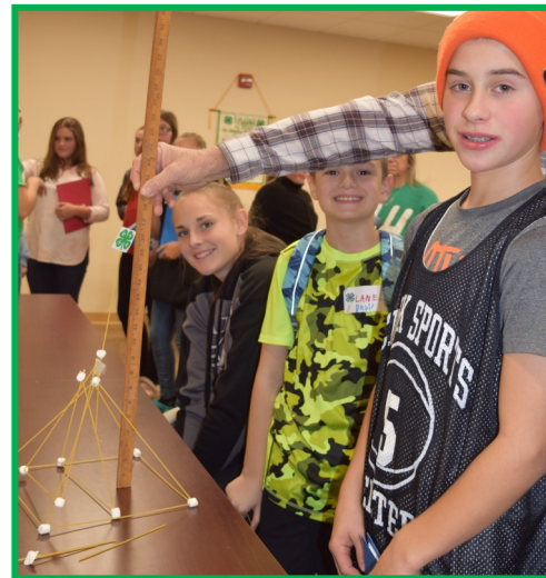
Winning 4-H Tower