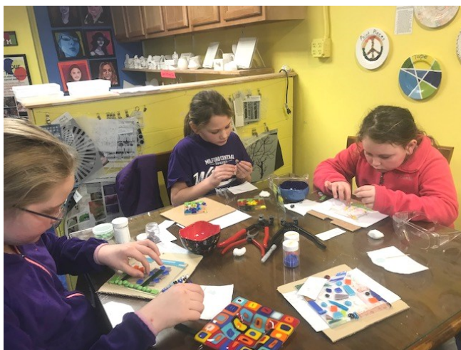
Otsego County Firecrackers - at The Studio for Arts & Crafts

Schedule your 4-H Club for a visit from Patti!!