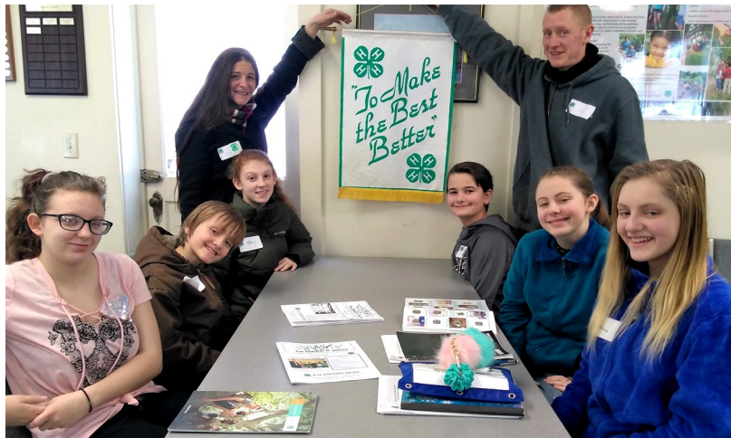
4-H Homesteaders – January 19 4-H Members and Leaders at Public