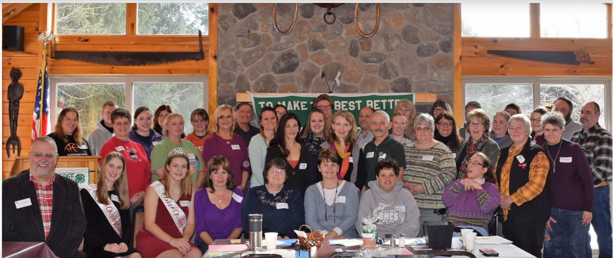
2019 LEADERS LUNCH

Add some clovers to your upcoming sewing and craft projects with new 4-H fabrics available at JOANN! Several 4-H fabrics are available in 500 JOANN stores for purchase or online. In our area: New Hartford Shopping Center, New Hartford, NY or 736 Vestal Pkwy E, Vestal, NY