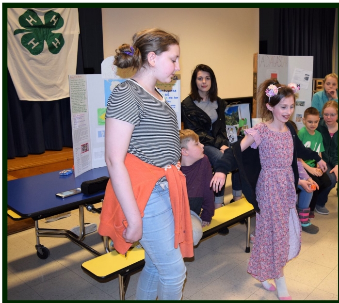
4-H International Night 2019—Rainbow Warriors demonstrate the Samba from Brazil.