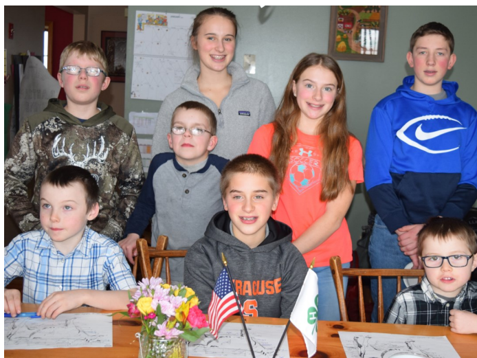
Springfield High Meadows – January 27 4-H Members smile for the camera