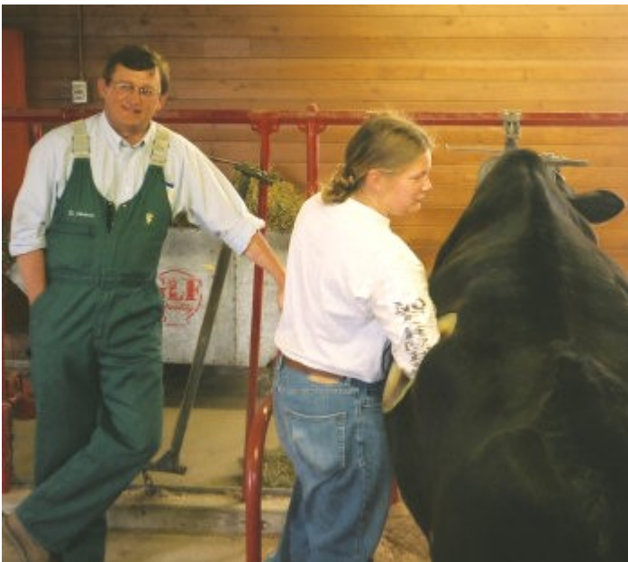
Holey Cow at Dairy Discovery Day

The annual Dairy Discovery program provides New York youth with fun, hands-on science-oriented learning experiences on dairy production and management topics which feature the unique facilities, industry professionals, and staff of Cornell University.