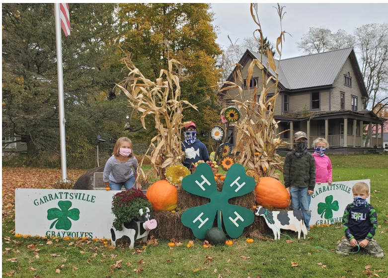
Garrattsville Graywolves 4-H Club display during National 4-H Week.