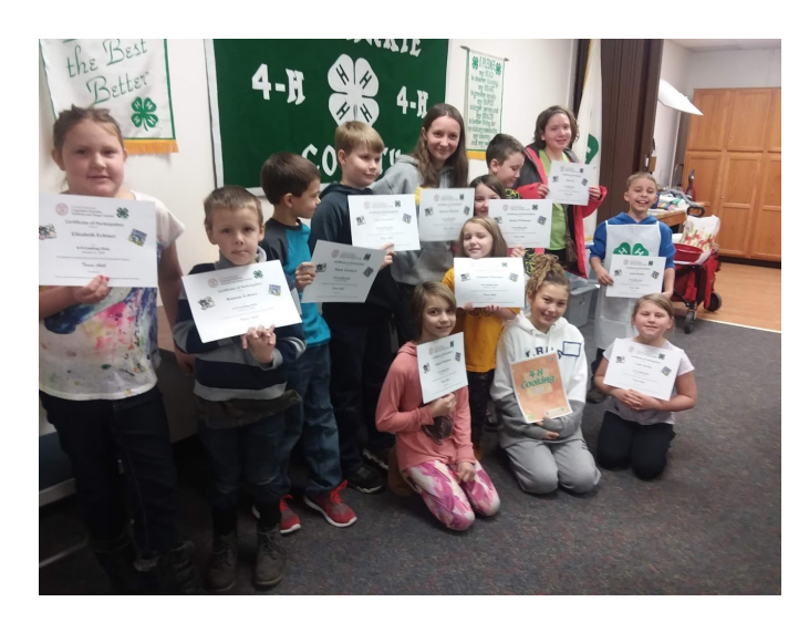
4-H Members attending the 4-H Cooking clinic learned kitchen and food safety, basic food preparation, and nutrition while making homemade cocoa mix, easy to fix green beans, sloppy joes, cornbread and magical fruit salad.