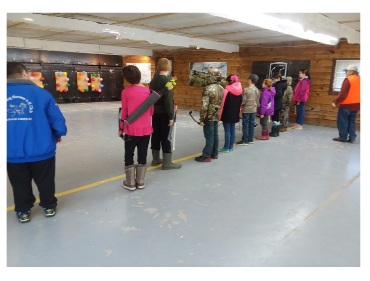
At the Middleburgh Rod & Gun Club 4-H members learned basic rules of safety, proper equipment selection and care and beginning shooting techniques at the 4-H Archery Clinic