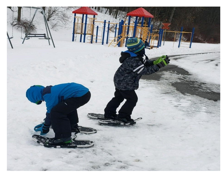
4-H members at the Cobleskill-Richmondville 4-H Afterschool program practice their snowshoeing techniques