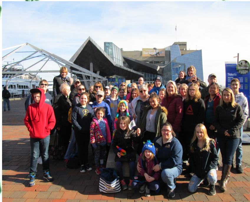
Schoharie and Otsego County 4-H members visit the Boston Aquarium

4-H is a community of young people across America who are learning leadership, citizenship and life skills.