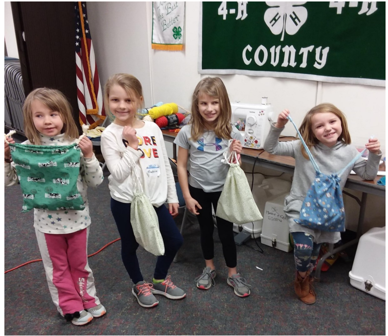
4-H members show off the drawstring bags they made at the Sewing Clinic.