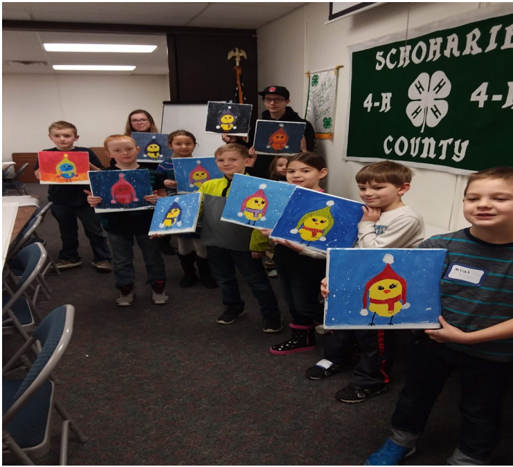
4-H members display their creations after participating in the Fine Arts painting workshop.