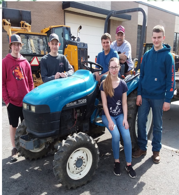
Graduating Class of 2019 4-H Tractor Safety Course

4-H is a community of young people across America who are learning leadership, citizenship and life skills.