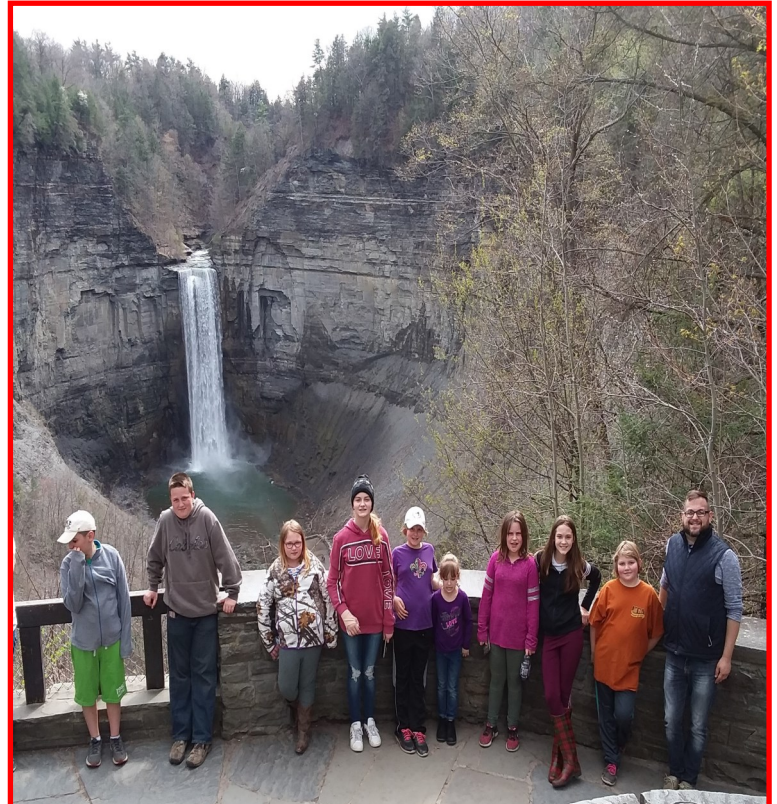
4-H members traveled to Reynold's Game Farm and Cornell Lab of Ornithology.