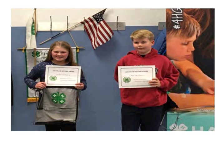
Above and Beyond Award