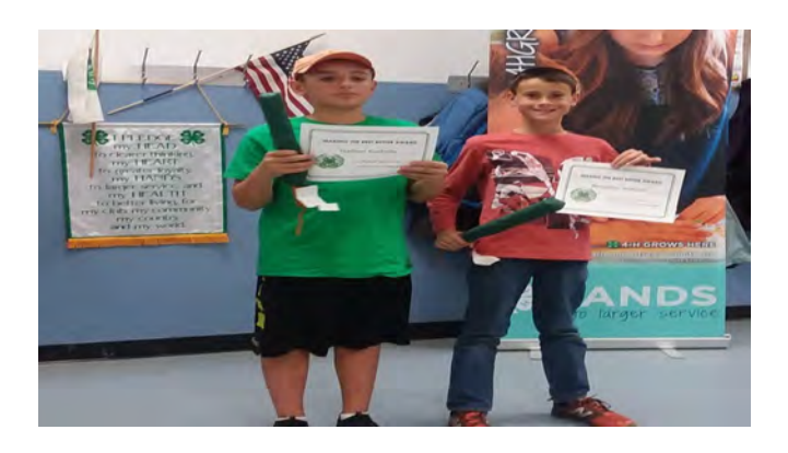
Making the Best Better Awards