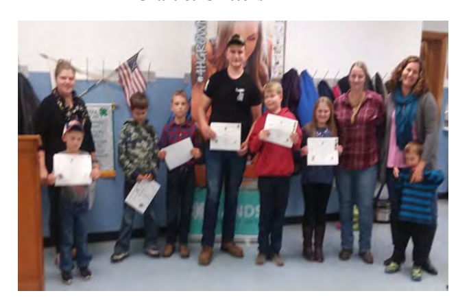
Die Hard Dairy