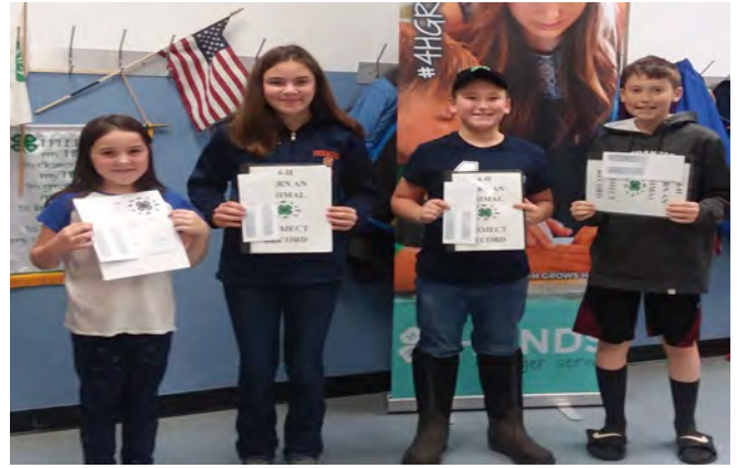
Earn An Animal