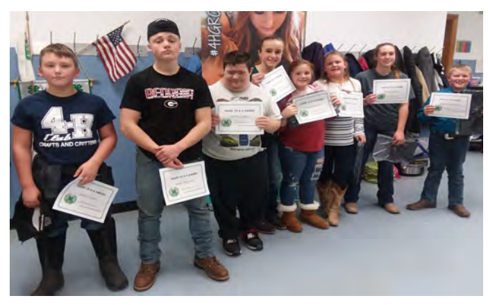
Heart of 4-H Awards