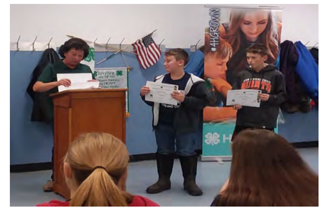
Craft & Critters