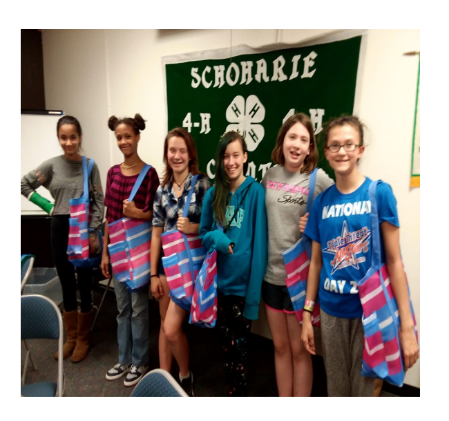
4-H members learning about running a babysitting business.

4-H is a Community of young people across America who are learning leadership, citizenship and life skills.