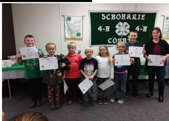
Craft & Critters