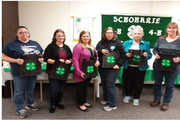
4-H Organizational Leaders