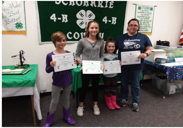
Independent Members and Leader