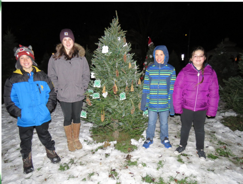
Members of the Animal Aggies 4-H club decorating the Schoharie County 4-H Tree in the Cobleskill Park.

4-H is a community of young people across America who are learning leadership, citizenship and life skills.