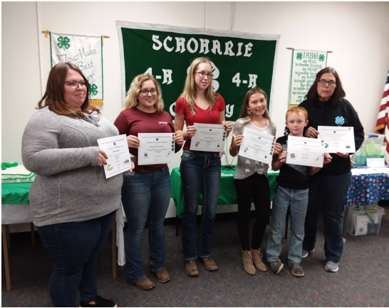
The Riders' Club