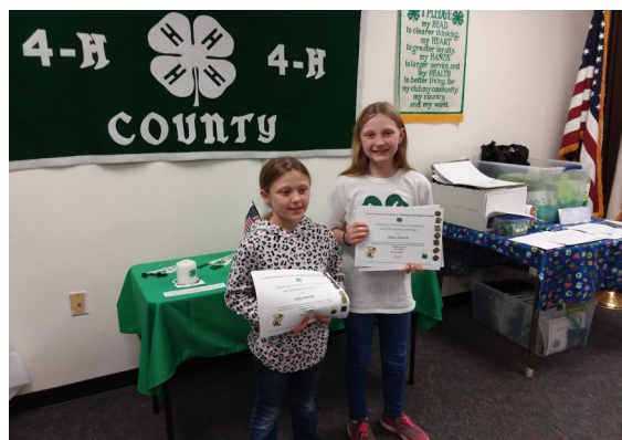
The Green Tree Club