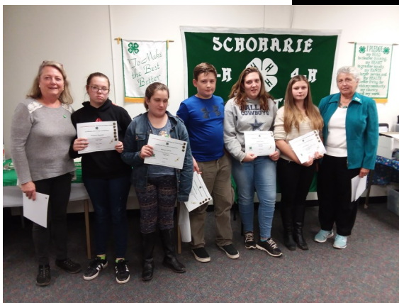
The Jefferson Generals