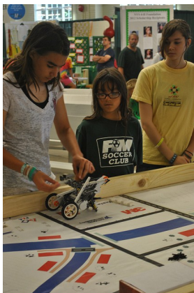
4-H members participate in the 4-H Robotics Challenge at the New York State Fair.

At a 4-H fair today, you might find children grooming their goats or shining up their saddles for the horse show, but it's just as likely that you'll find them programming their robot or displaying a community map made with GIS data.