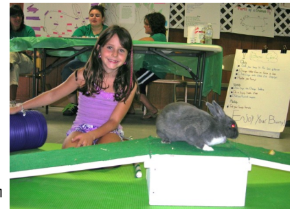
A 4-H member presents how to care for a pet rabbit. Along with basic care, she has also made an agility course for her rabbit at a local fair.

of this while handling the excitement and nerves that come from public presentation.