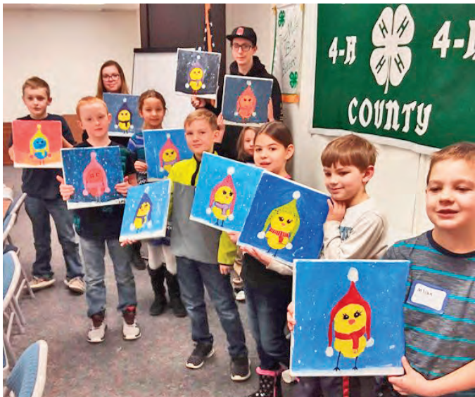
A fun all-ages indoor project from a past year

At Schoharie County 4-H, we are looking toward our traditional winter activities. Clubs and county-wide offerings will be moving toward indoor project areas as the temperature drops and snow begins to fall. While still maintaining safety protocols, this winter appears to be more conducive for youth to gather for club meetings and project activities.