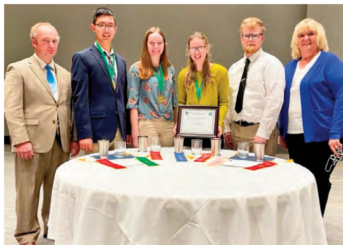
At the NYS 4-H Dairy Bowl

"For my Earn-an-Animal, I chose a Holstein. I have been showing for as long as I can remember, and this year I did not have an animal for show season, so I knew that I would have to buy one. I bought a Holstein summer yearling. This project has taught me responsibility and ownership. I have also been able to track things that I've never even thought about before, such as her feed intake and her feed rations. I have already been to two shows with her, and I am very excited to see what the future holds for us."