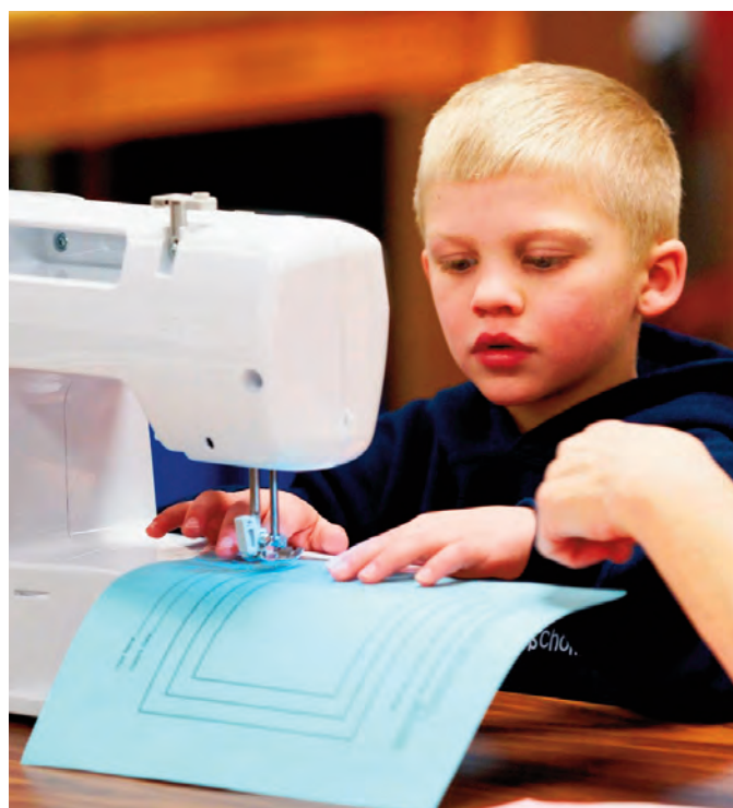
At a sewing clinic in a past year

January is traditionally the month we have offered a textile clinic, and this year is no different. We will be holding clinics on sewing, knitting, crocheting, and embroidery on Saturday afternoons throughout the month. These are usually very popular workshops, indicating that some things never go out of style!