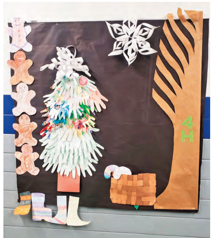
The seasonal bulletin board showing off the latest creations

As the seasons change, they continuously work on updating the bulletin board. The holiday season evergreen tree was created by tracing the handprints of staff and children in the program, cutting them out, and then layering them to create the look of overlapping branches.