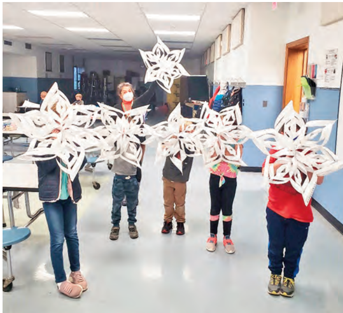
Snowstorm created by the children

Indoors, the children worked hard to make giant snowflakes. It required lots of cutting, following detailed directions, and first-rate folding skills to complete the snowflakes. They showed a lot of diligence through some of the more tedious parts of the project and were very pleased with their accomplishments!