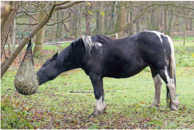
A soft rope slow-feed hay net

rope material can help slow down the particularly voracious eaters and those on restricted diets. Large rocks placed in the horse's grain bucket slow their consumption of concentrates. Foraging-treat dispensers give the horse something to do when they must be confined and can help fulfill the desire to graze.