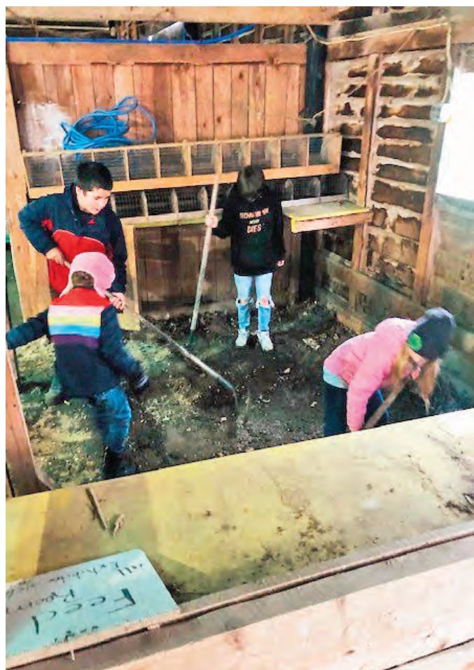
Cleaning up after the chickens

The members and families of the Otsego County 4-H club America's Funniest 4-H'ers have been revitalizing the poultry barn on the Otsego County Fairgrounds. They have been working hard cleaning up old spaces and building new spaces.