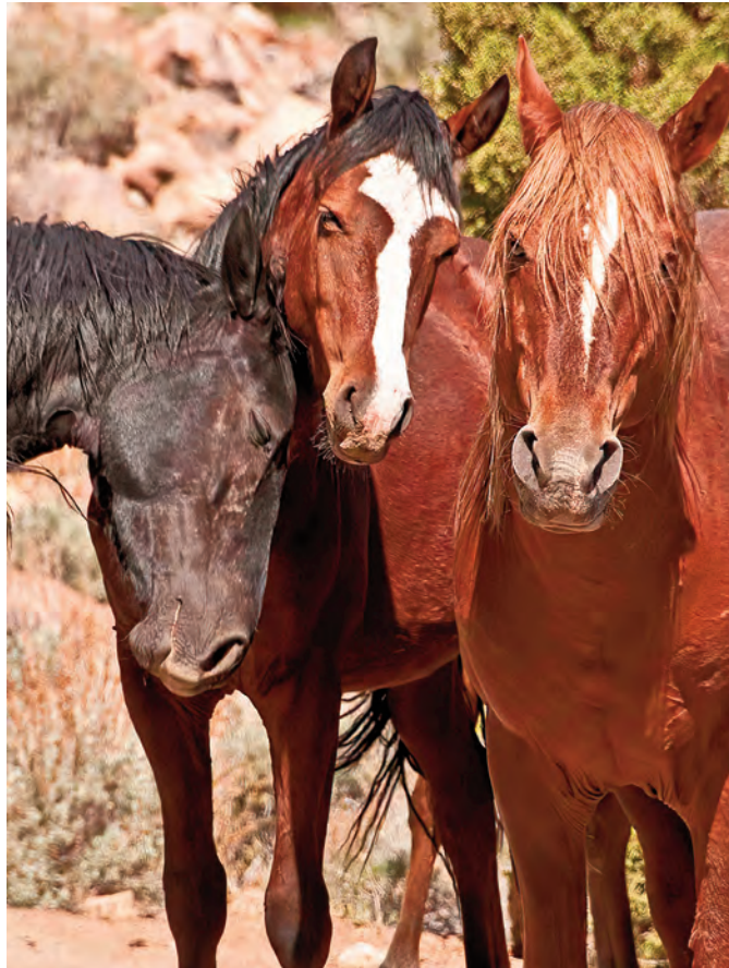
A social herd