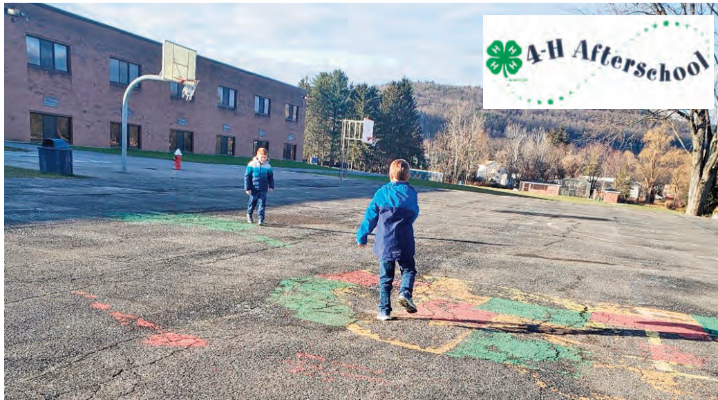
Outside playing freeze dance