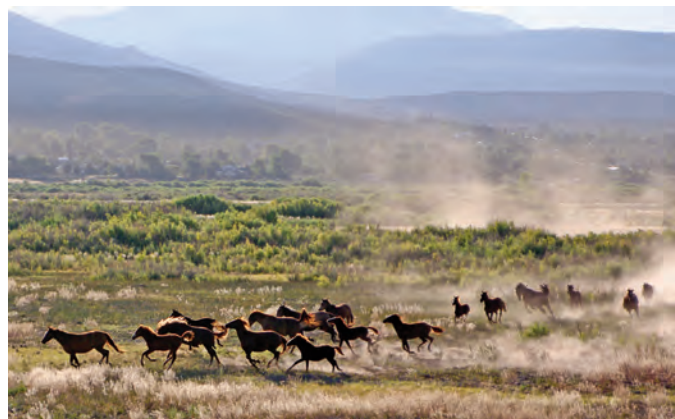
A feral herd of horses

Feral horses often travel upwards of 20 miles per day with their herd, grazing most of the time. A diet of concentrated grains and limited forage fed to a confined horse with limited social outlets leads to boredom, anxiety, and loneliness, and contributes to the adoption of vices. Some enrichments like toys, non-breakable mirrors, treats, and licks can provide entertainment to a stalled horse but cannot replace a balanced diet and ample turnout time with a well-matched social group.