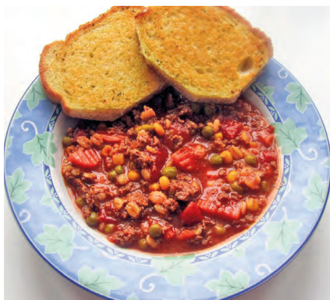
Beefy Vegetable Barley Soup with Garlic Toast

Find a printable version with nutrition facts here: www.cceschoharie-otsego.org/speedy-beef-barley