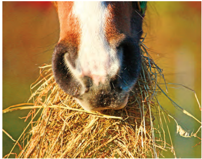
Vary your horse's forage types

Contrary to some theories, cribbing is not likely a learned behavior and horses have not been proven to begin cribbing after observing another horse performing the behavior. The cause of cribbing is strongly linked to a horse's diet, and multiple horses living under the same management