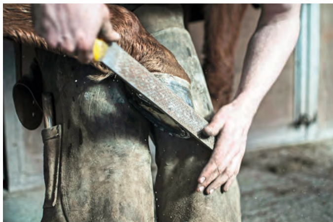
A farrier at work

sional for an exam. Pain is more motivating than your reward can ever be, and chronic pain may result in aggression. For example, if you're trying to teach your horse to lift their hind feet for the farrier, but arthritis pain in their hocks is causing them to kick out, the arthritis must be addressed, rather than punishing the horse for kicking.