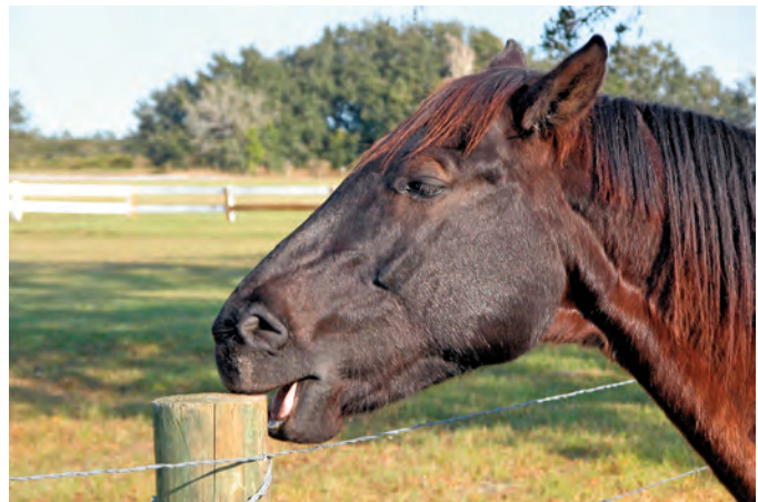
Wood chewing does more than damage your fence!

conditions are more likely to acquire the same behavior. Increasing the total amount of forage offered through more frequent, smaller feedings, and varying forage types (pasture, long stem hay, hay cubes, beet pulp) can decrease the prevalence of cribbing behavior. Once it becomes a compulsion, though, cribbing is often most effectively controlled with a purpose-specific collar, as the behavior will often persist despite management changes.