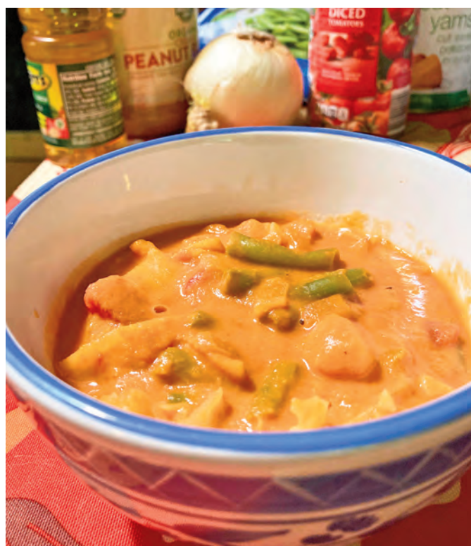
A version of maafe, "African Sweet Potato Stew"

Our culture is steeped in soup references: phrases like "from soup to nuts" and "thick as pea soup;" the traditional children's story about how we are better when sharing, "Stone Soup;" the bestselling series of inspirational stories, Chicken Soup for the Soul ; and even the TV series Seinfeld lifted soup's profile with its 116th episode, "The Soup Nazi."