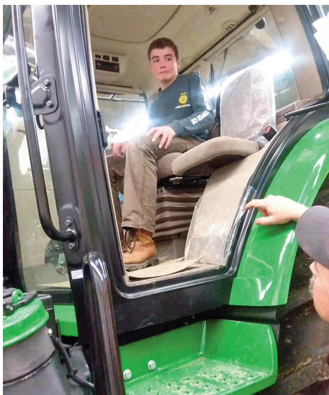
Getting guidance at the National Safe Tractor and Machinery Operation course