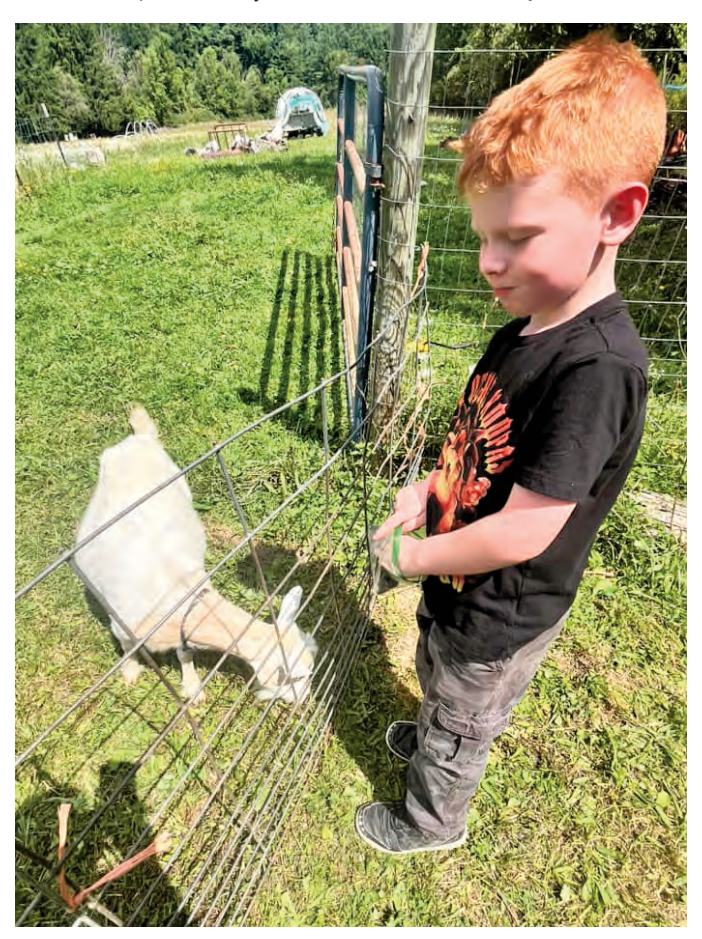
Giving goats a snack at Abba's Acres in Cobleskill.