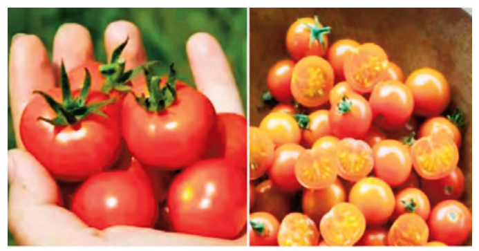
Small/Cherry Tomato Category: Sweet 100 and Sun Gold tied

The tasting was a chance to think about what tomato you'd like to grow in your 2025 garden as well as talk to gardeners who had grown the tomatoes. Tasting offers much more than beautiful catalog photos. Our tasters took their task very seriously. When votes were counted, there were many favorites but these tomatoes topped the list: