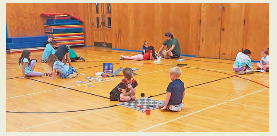
The students who know how to play chess are teaching chess to the other children. They enjoy playing chess and ask to play frequently.

The 4-H Afterschool Program (ASP) at the Schoharie Central School is starting the school year with the students designing their clubs. The newspaper club is just getting organized so they will resume their writing in the next edition.