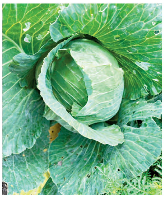
VVTG Cabbage at the demonstration garden in Cobleskill maintained by the Schoharie Master Gardener Volunteers