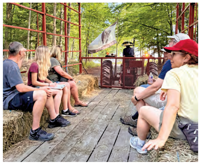
Enjoying a hay ride at Maple Hill Syrup Farm in Cobleskill.