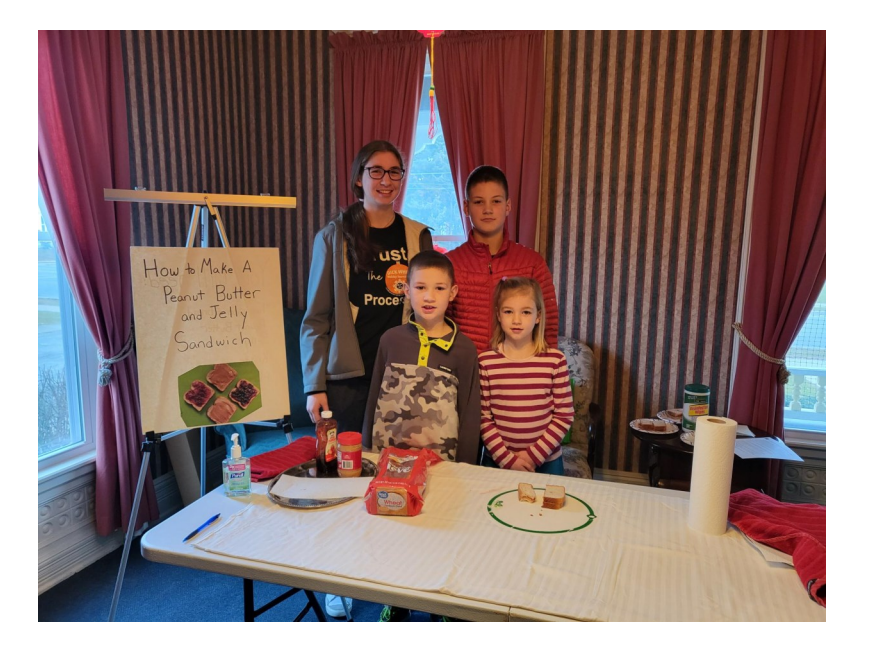
4-H Members attended the Public Presentations Workshop to learn new speaking skills and practice their presentations.

ornell Cooperative Extension provides equal program and employment opportunities. Accommodations for persons with special needs may be requested by contacting Cornell Cooperative Extension Schoharie and Otsego Counties prior to a program.