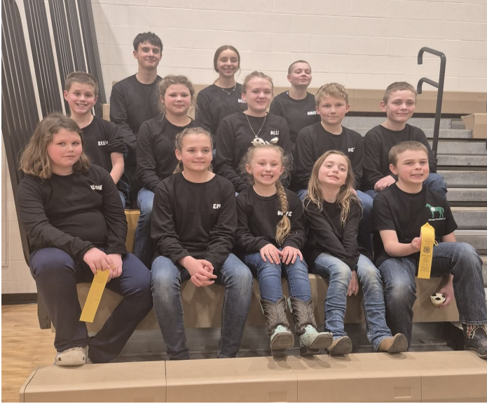
In March Otsego County 4-H Dairy Bowl participants competed at the South Central Regional 4-H Dairy Bowl held in Greene.