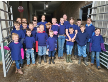
In April Otsego County 4-H held the 4-H Dairy Calf Sale at Hoskings Sales.