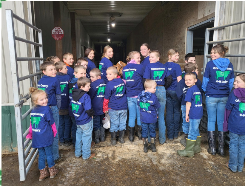
Otsego County 4-H youth at the 2026 4-H Dairy Calf Sale held at Hoskings Sales

4-H is a community of young people across America who are learning leadership, citizenship and life skills.