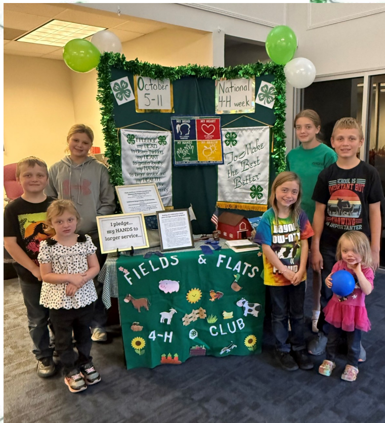
Fields & Flats 4-H Club during National 4-H Week

4-H is a community of young people across America who are learning leadership, citizenship and life skills.