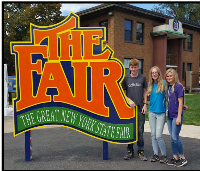
Schoharie County Hippology Team at the NYS Fair

4-H is a community of young people across America who are learning leadership, citizenship and life skills.