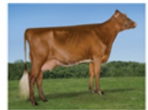
MILKING SHORTHORN Magellan 9th Perfect Round -- E3-80 34 382 D 24.870 M 3.9% 645 F 3.4% 574 P Magellan Valley Farms, Oconomowoc, Wis.

Winners of the 2019 Hoard's Dairyman Judging Contest Classes