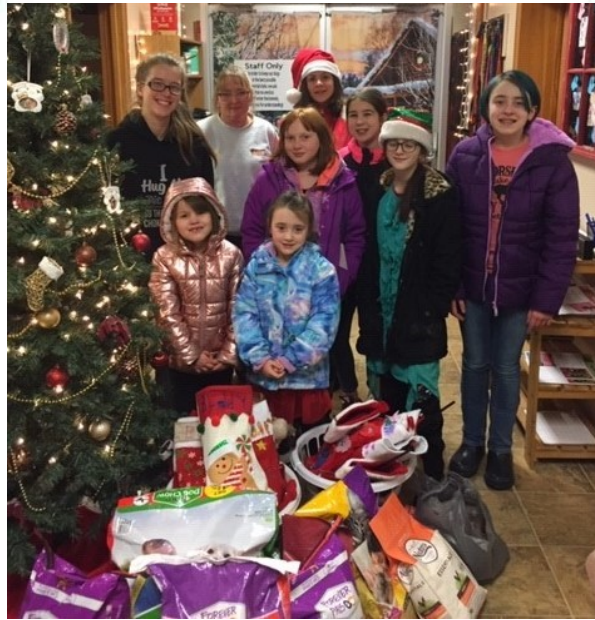
Mountain Maniacs 4-H Club filled 20 gift stockings for cats and dogs at the Ayers Memorial Animal Shelter in Sprakers.