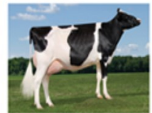
2019 Hoard's Dairyman Supreme Winner HOLSTEIN -- Grand Acres Almost Lady ET -- E3-84 ZE 34 382 D 27.873 M 4.3% 5.370 F 3.2% 866 P Grand Acres, Canton, N.Y.