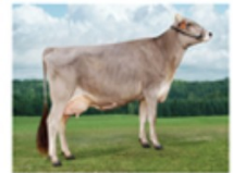
BROWN SWISS -- SB HP Twilight Dany ET -- E3-92 34 382 D 26.290 M 4.4% 5.298 F 3.4% 1,008 P Vogel Farm, Woodstock, Wis.