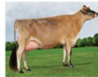
2019 Hoard's Dairyman Reserve Supreme Winner JERSEY -- Meadow Ridge Veritas Claire Meadow Ridge, Cumberland, Wis.