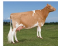
GUERNSEY -- Alltop Acres Garys Liban -- E3-90 37 385 D 22.520 M 4.2% 486 F 3.6% 779 P Alltop Acres, Sherman, Wis.